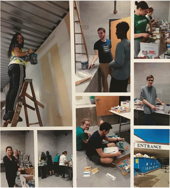
Members of the Youth in Philanthropy Council and other student volunteers work to create a Care Closet at Torrington High School

For more information about the Legacy Society and leaving your own legacy, please contact Philanthropic Services at 860.626.1245.