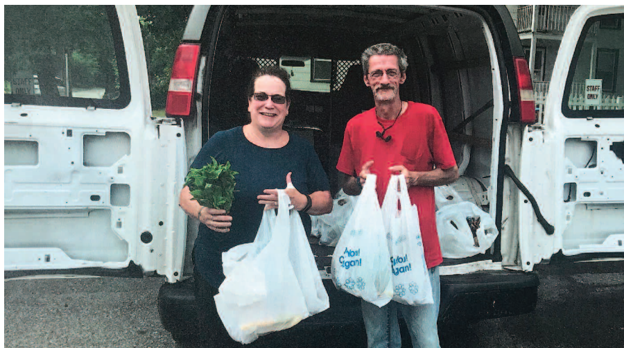
Fresh produce arrives at FISH of Northwestern Connecticut as part of a grant to the Northwest Hills Council of Governments to provide healthful vegetables to those suffering from or at-risk of developing diet-related disease.