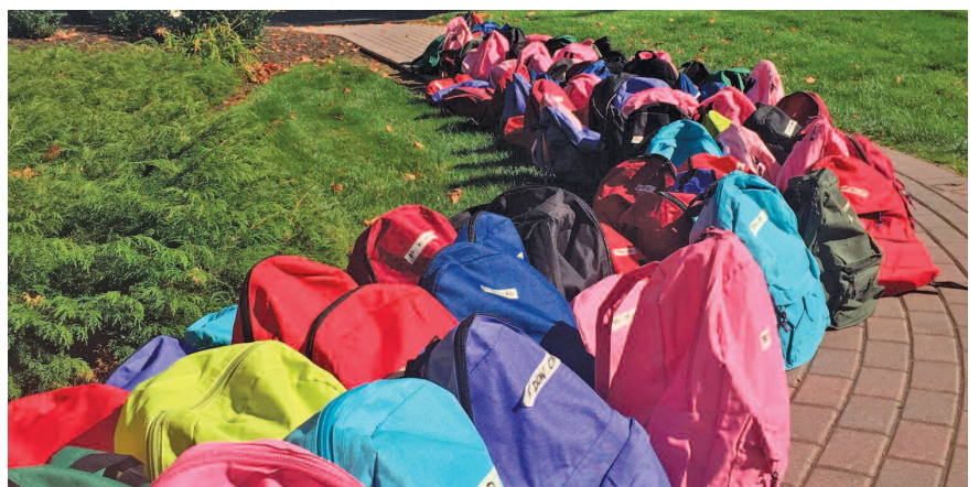
Backpacks filled with food lined up for delivery to food insecure families with children in Torrington elementary schools made possible by the Northwest CT Community Foundation Lucia Tuttle Fritz Fund

As recovery efforts continue, Community Foundation funds continue to support our most vulnerable neighbors throughout the Northwest Corner. Early 2021 grants have supported FISH of Northwestern Connecticut, Cornwall Food and Fuel, Gifts of Love, Community Kitchen