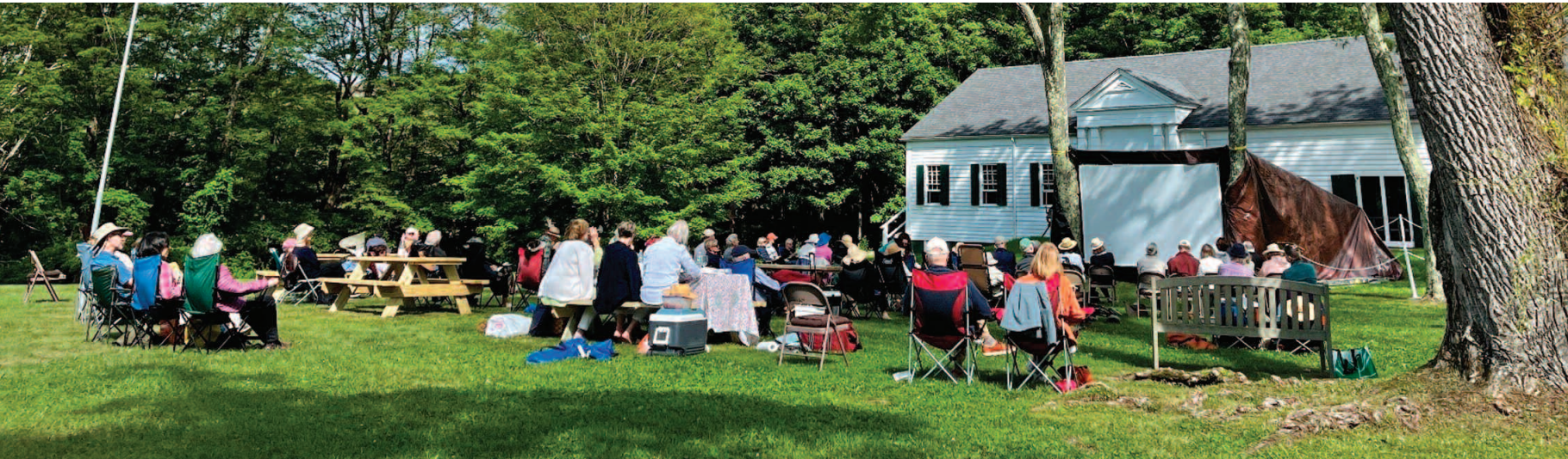
Concertgoers enjoy a live-streamed performance on the grounds of Music Mountain on July 4, 2021

In the rolling hills of Falls Village, there is a small collection of buildings, tucked amid lush grounds. It is home to Music Mountain, a chamber music festival venue, an educational workshop, a place for community to gather and connect through live music—and the embodiment of an almost 100-year old dream.